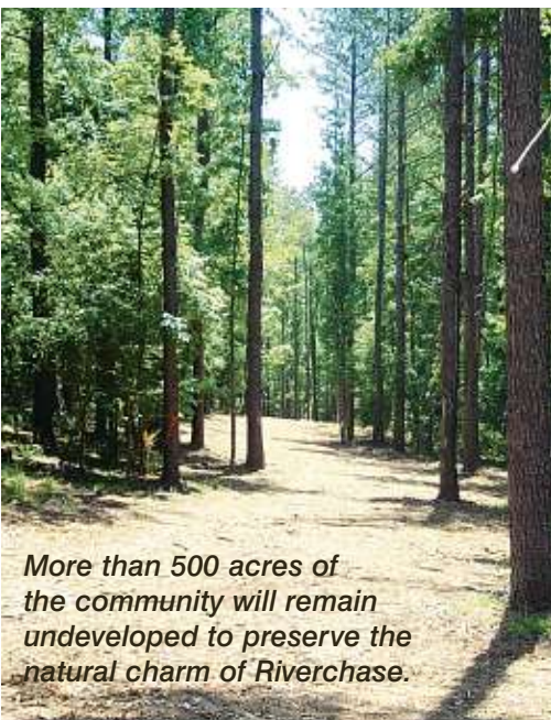
More than 500 acres of the community will remain undeveloped to preserve the natural charm of Riverchase.